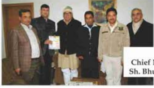
Meeting with Chief Minister of Haryana - Sh. Bhupinder Singh Hooda