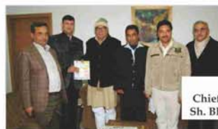
Meeting with Chief Minister of Haryana - Sh. Bhupinder Singh Hooda