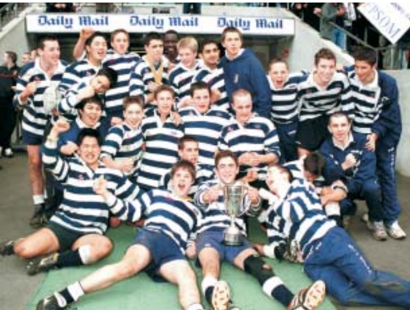
Daily Mail national rugby champions.

Pupils have represented county and country in many sports including shooting, athletics, rugby, tennis hockey and swimming.